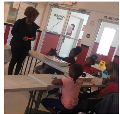
Youth making stress balls