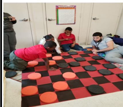
Youth Game Day